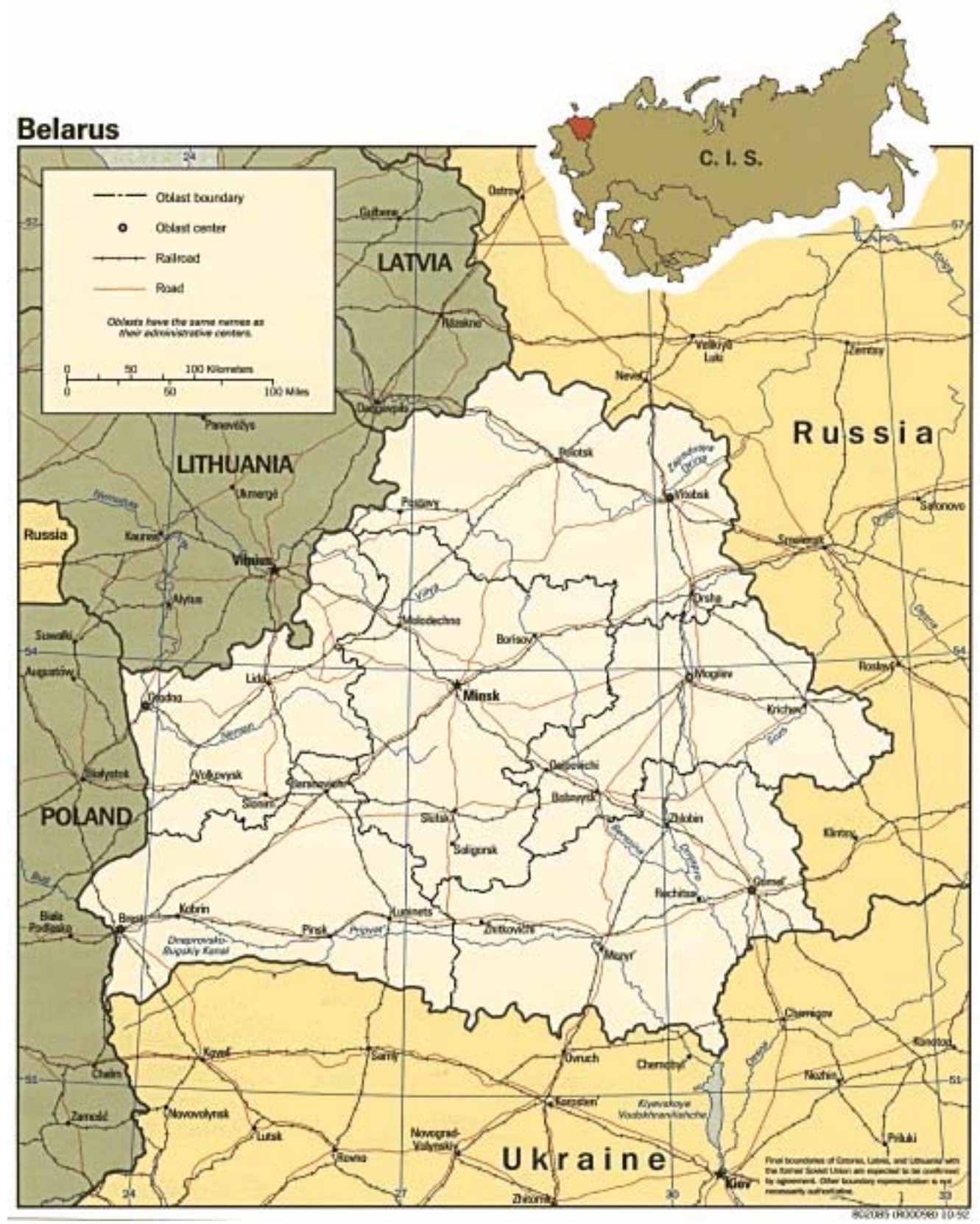
Belarus in 2005. Bialystok is in Poland.