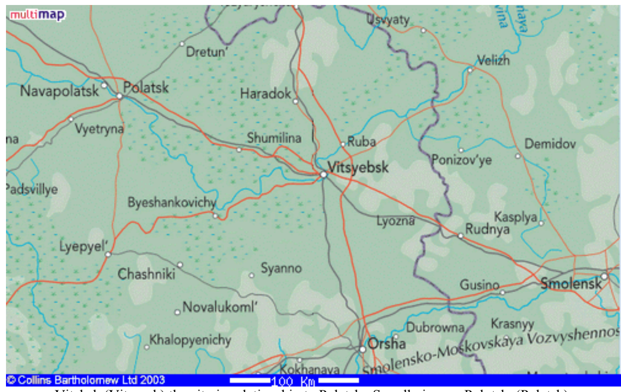
Vitebsk (Vitsyesk) the city in relationship to Polatsk. Sverdly is near Polotsk (Polatsk).